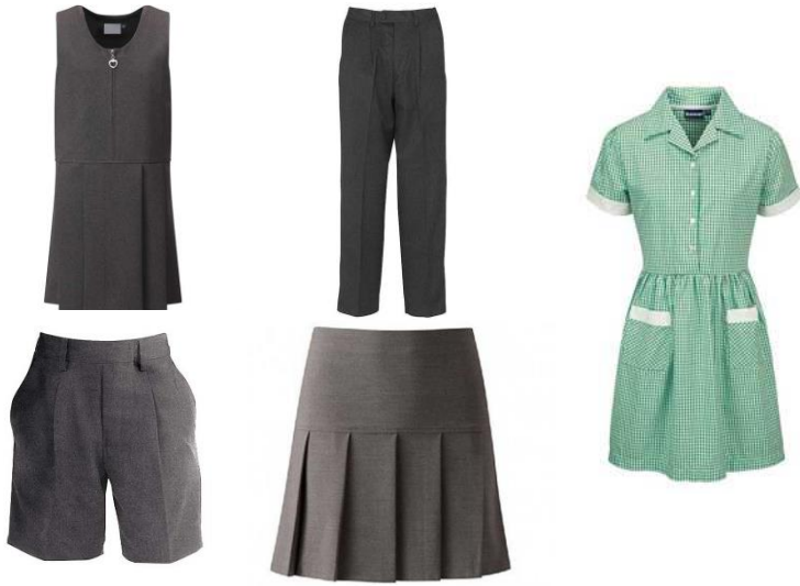
Grey pinafore/Summer dress, skirt, trousers or shorts