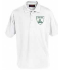
White blouse, white/green polo shirt