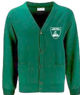
Dark green sweatshirt, pullover or cardigan