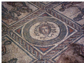
Roman mosaic examples