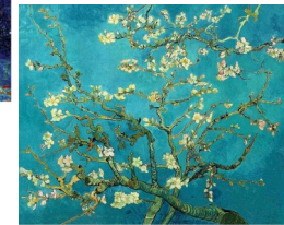
Blossoming Almond Tree - Vincent Van Gogh