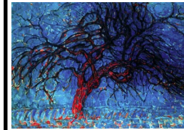
The Red Tree - Piet Mondrian