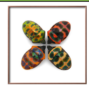
Four shield bugs