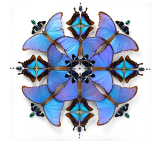
Limited Pericles Confluence