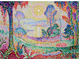
Coucher de Soleil