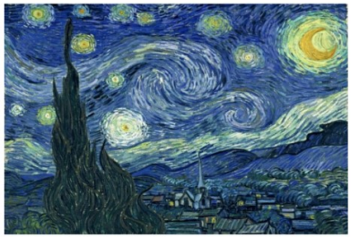
Van Gogh - Starry Night